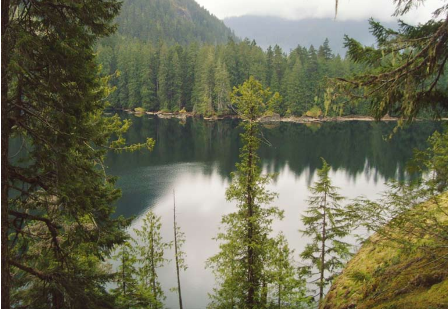
▲ The Brothers (or The Olympic Mountains), hidden in the mist, stand tall in the distance.

flowers, these evergreens are indispensable. They render habitat possible by providing timber, and also sustain the environment by acting as lungs of the earth.