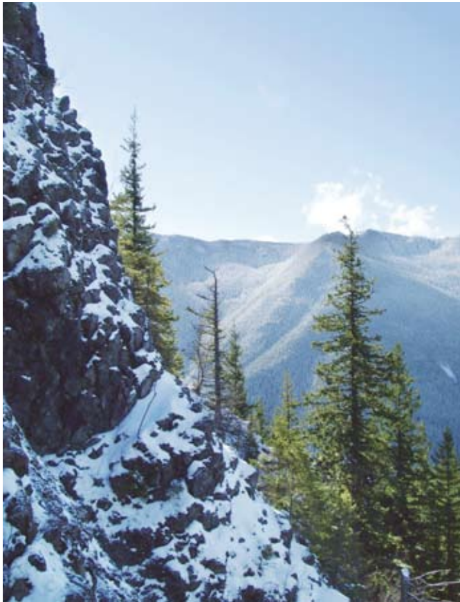
▲ Above: The icy flanks of Seattle have a cool evergreen atmosphere. Below: A cascading waterfall is an ideal photographic opportunity.

the Olympic Coast near Rialto Beach. These beaches are not sunny. The water there is not warm. The waves smash onto the rocky cliffs in a never-ending sequence. There are no beach bars, sunbathers or walking promenades. Approachable on dirt trails, these beaches are backed by sheer bluffs and thick rainforests and are ideal for an adventure in the wilderness.