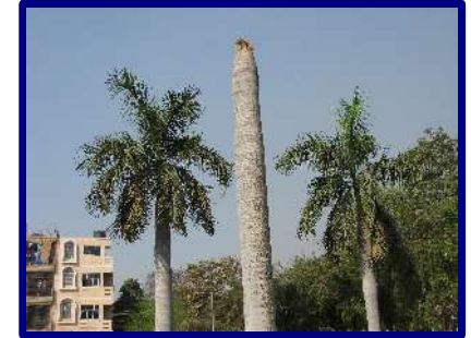
Two healthy and one topless Royal Palms, in the same park

Royal Palms were brought to India from the Caribbean, and are now common ornamental plants. A fast growing palm, they can tolerate drought, proximity to salt water, and hurricanes. They are identifiable by their spray of feather-like leaves, and the bright green stem just below the crown.