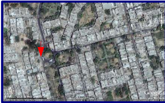
Malviya Nagar bus circle, centre left

In the South Delhi suburb of Malviya Nagar, a strangely hollow Royal Palm stands proudly in a small city park. After Hindi lessons at the nearby Hindiguru, I'd visit this park and wonder at this specimen. Walk southwest from the market street, and at the bus circle, turn left. At that corner, you'll pass between a park on the right and a temple on the left. Continue straight (ENE)- in the second park on the right, the Shatter Palm tree is in the centre.