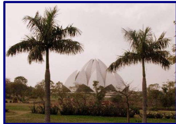
Royal Palms at B'hai Lotus Temple Gardens, SE Delhi

Palms are a diverse and widespread group in the subtropics and tropics. They are more closely related to grasses and onions (monocots) than they are to most other woody trees. Well-known-and tasty- palms include the date and the coconut. In some tropical regions of the world, clearing of land to palm plantation for oil production is a major threat to the rainforest.