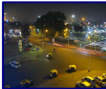
Across Barakhamba Rd

CP was designed in 1932 and continues as British New Delhi's commercial hub. From high fashion to shoelaces, dosas to electronics, its all there. But the place is vast and landmarks are few; it's easy to get disoriented amongst the countless white pillars... Look for the 4:30 Fig! When its time to escape, hop underground into the Metro and travel into Old Delhi- the contrast is striking.