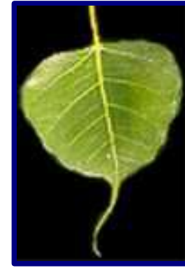
Instantly recognizable leaf