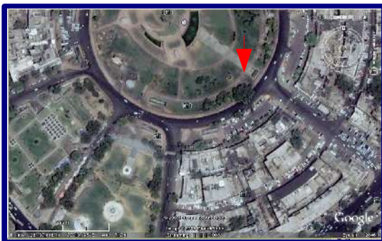
CP's southern half

Located at Connaught Place Inner Ring at Barakhamba Rd, this tree predates the Metro station built underground directly beneath it. Delhi's large circular shopping district can be a maze, but if CP is a clock dial, this large and healthy Ficus religiosa is a perfect landmark at 4:30. It is definitely the largest tree within the CP circles, and is a popular hangout with the birds of the area.