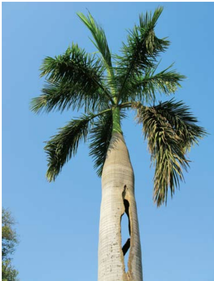
Clockwise from above: A curious specimen: a hollow royal palm tree in a park at Malviya Nagar; Pilkhan fig in South Delhi; Trekkers in the Sanjay Van Forest of South Delhi.